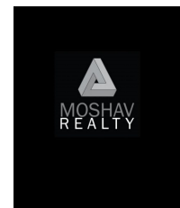
Rental Enquiries 02 9188 5000