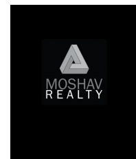
Rental Enquiries 02 9188 5000