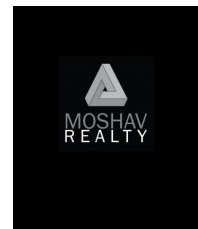
Rental Enquiries 02 9188 5000