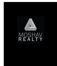
Rental Enquiries 02 9188 5000