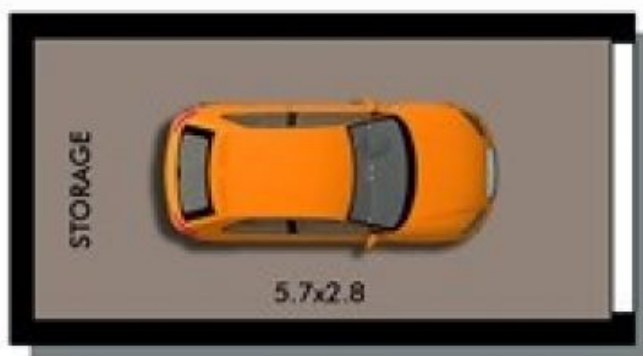
L. U. GARAGE